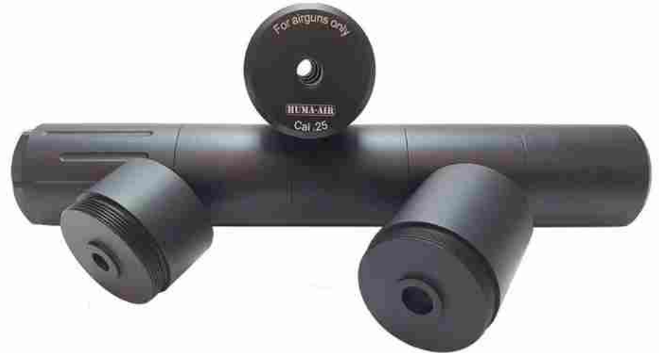
MOD40-5/0 = Long | 22.8cm