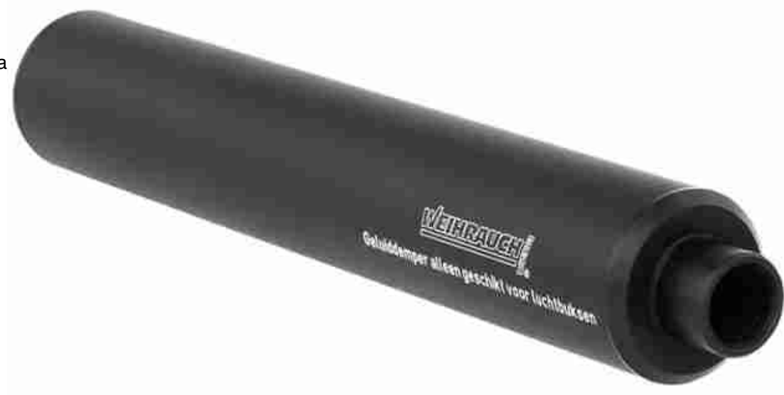
The originally for the HW100 developed silencer – fits 1/2 UNF

https://www.waffen-schlottmann.de/1168812_Schalldaempfer-der-Marke-Weihrauch-fuer-Luftgewehr-mit-Innengewinde-0-5-Zoll-UNF.htm