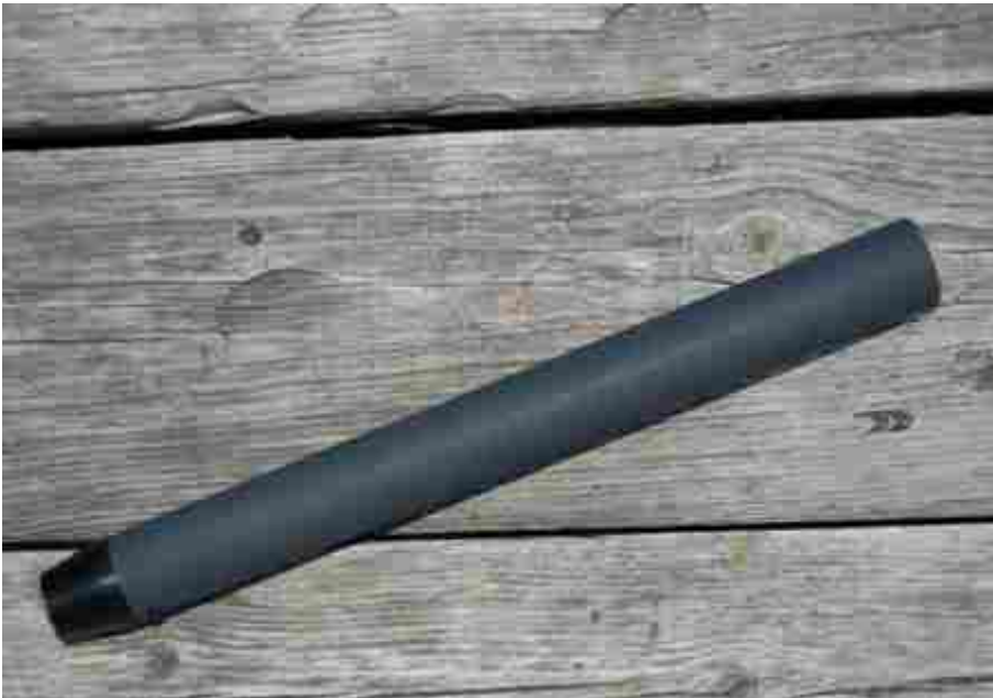
“Gun metal gray”

For ideas and options , cf. the following photo gallery: http://www.tko22.com/TKO_gallery/