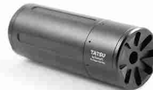
1.6 x 4.25 inches TATSU