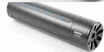
1.6 x 6.25 inch SUMO