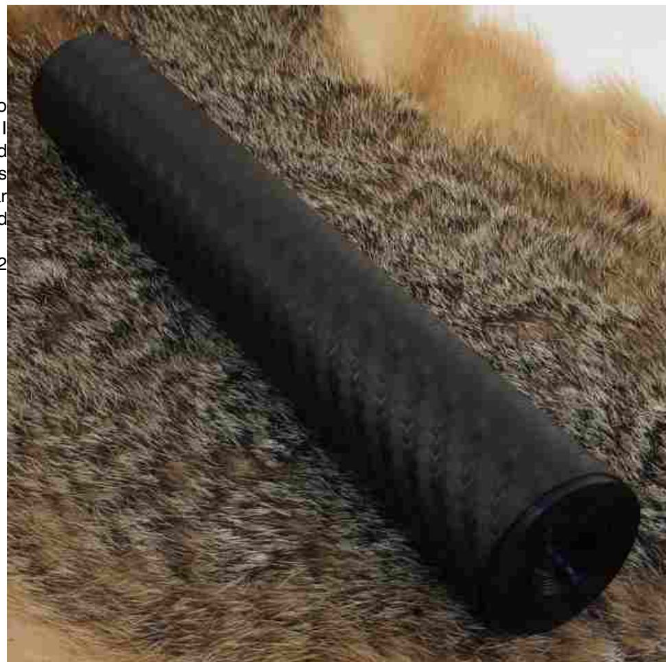
Construction: 3D printed monocoire set in a polymer shell with a decorative vinyl wrap

https://www.gatewaytoairguns.org/GTA/index.php?topic=178083.msg156020266#msg156020266