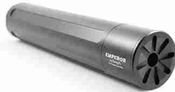
2 x 10.5 inches EMPEROR v3