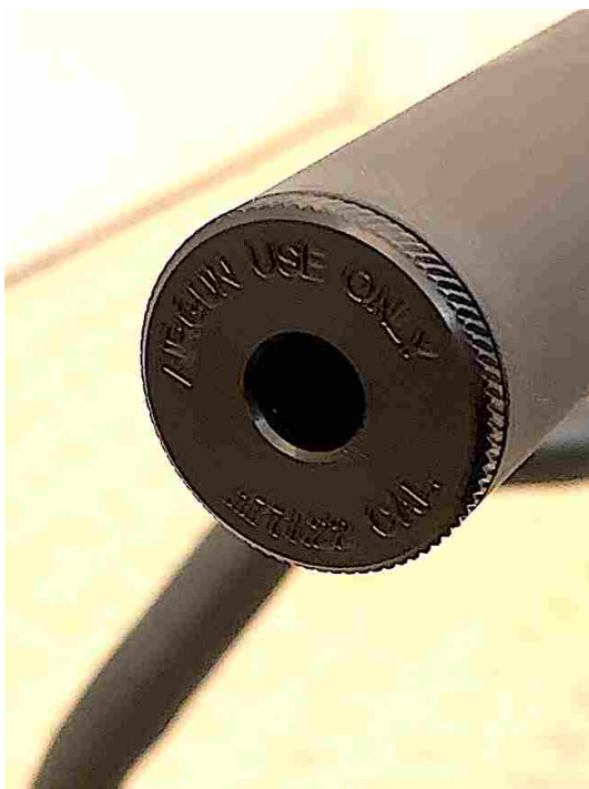
PICS of A.U.O. (MM1)