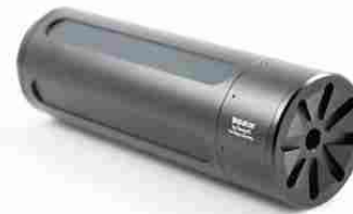
2 x 6.25 inch RONIN