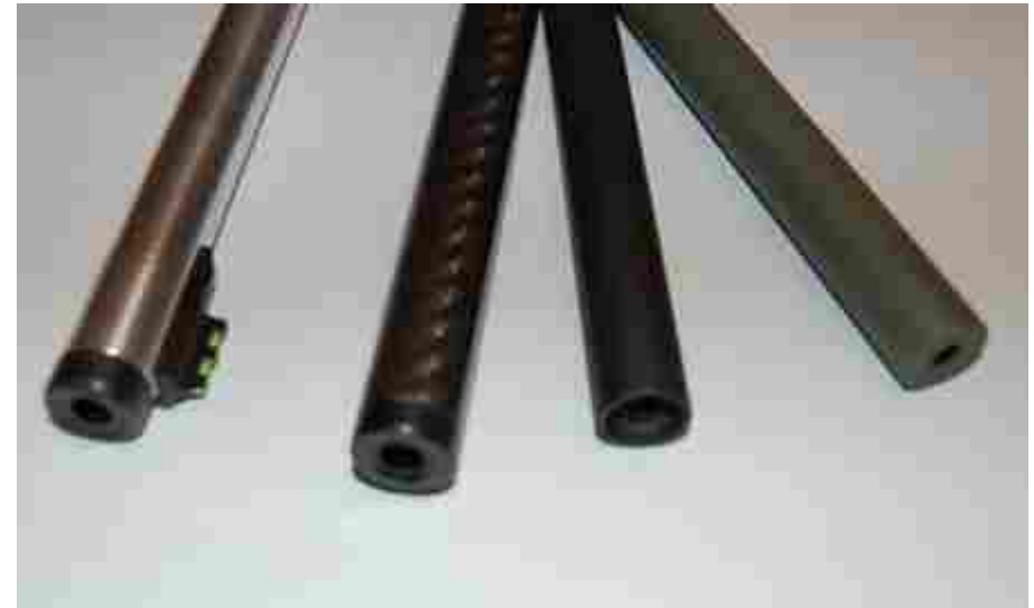
Various end pieces