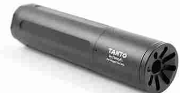
1.22 x 5 inches TANTO