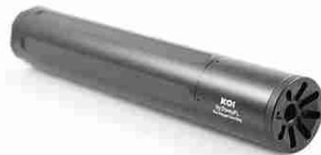
1.22 x 7 inches KOI