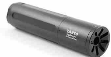
1.22 x 5 inches TANTO