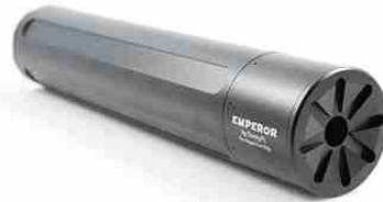
2 x 10.5 inches EMPEROR v3