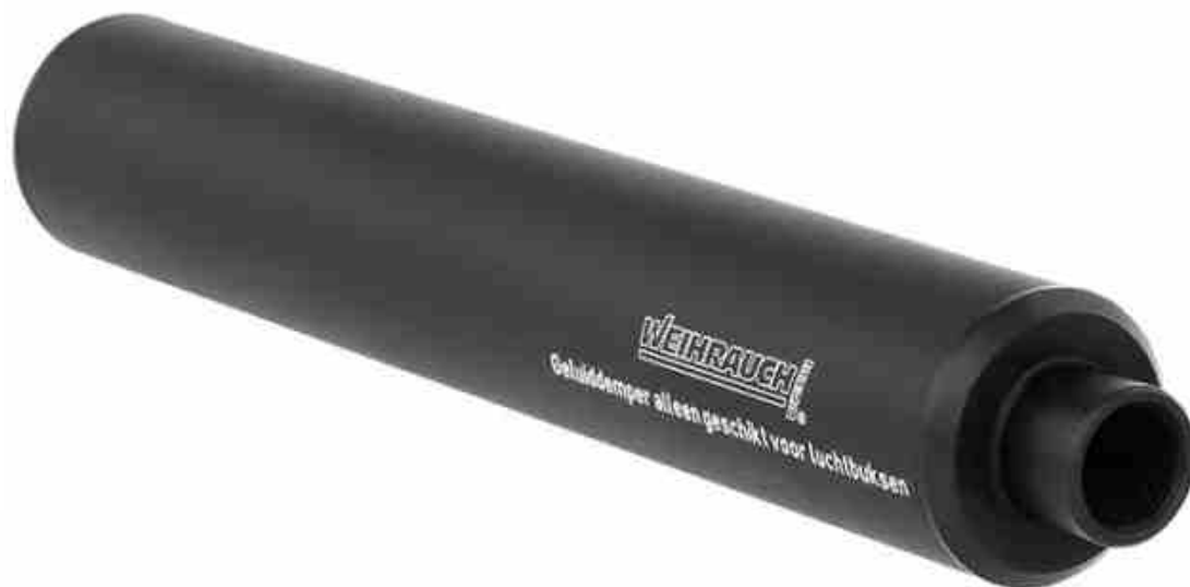
The originally for the HW100 developed silencer – fits 1/2 UNF

https://www.waffen-schlottmann.de/1168812_Schalldaempfer-der-Marke-Weihrauch-fuer-Luftgewehr-mit-Innengewinde-0-5-Zoll-UNF.htm