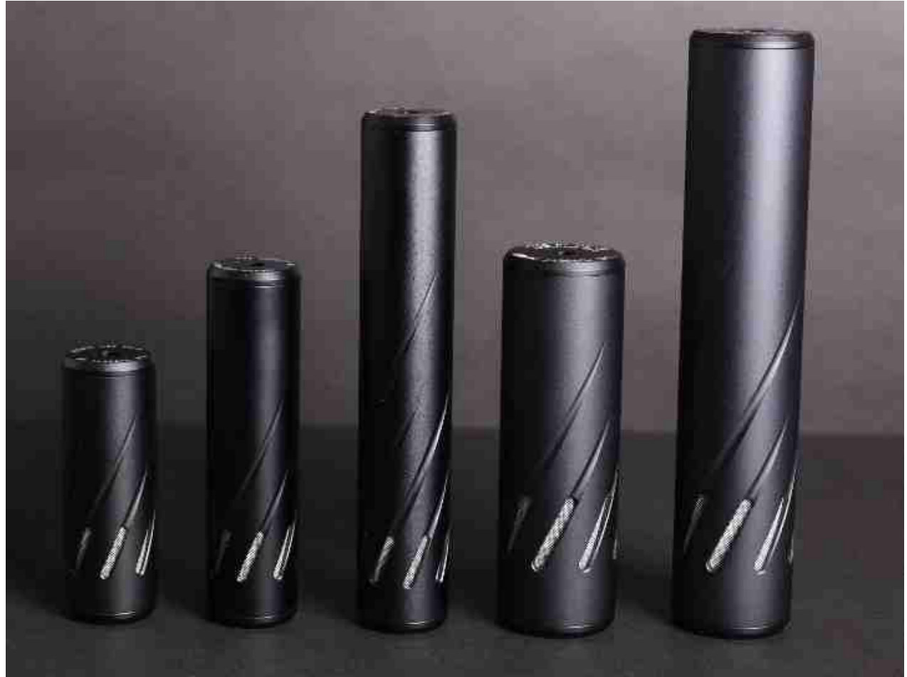
L to R: Atom, Belita, Snipe, Mini-Magna, Magna.