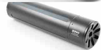
1.6 x 6.25 inch SUMO