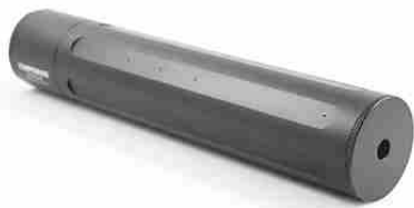
2 x 10 inches EMPEROR v2