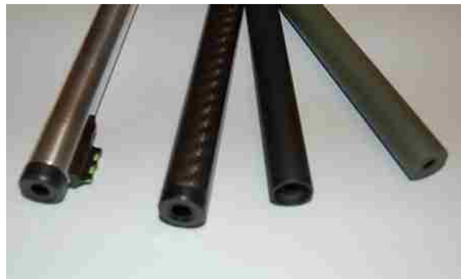
Various end pieces