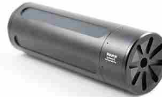
2 x 6.25 inch RONIN