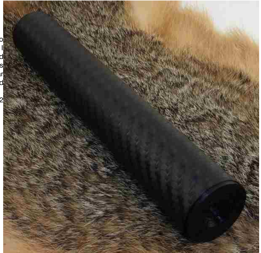
Construction: 3D printed monocoire set in a polymer shell with a decorative vinyl wrap

https://www.gatewaytoairguns.org/GTA/index.php?topic=178083.msg156020266#msg156020266