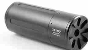
1.6 x 4.25 inches TATSU