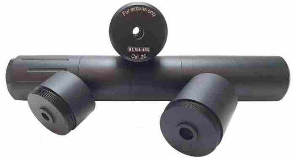
MOD40-5/0 = Long | 22.8cm