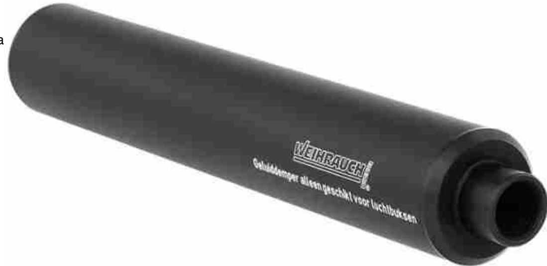
The originally for the HW100 developed silencer – fits 1/2 UNF

https://www.waffen-schlottmann.de/1168812_Schalldaempfer-der-Marke-Weihrauch-fuer-Luftgewehr-mit-Innengewinde-0-5-Zoll-UNF.htm