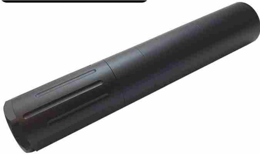
Modular Moderator Mod30-3/1