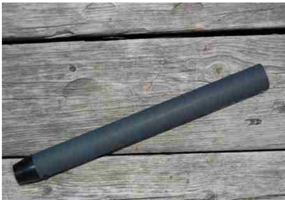
“Gun metal gray”

For ideas and options , cf. the following photo gallery: http://www.tko22.com/TKO_gallery/