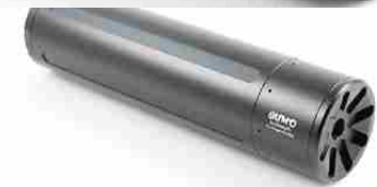
1.6 x 6.25 inch SUMO