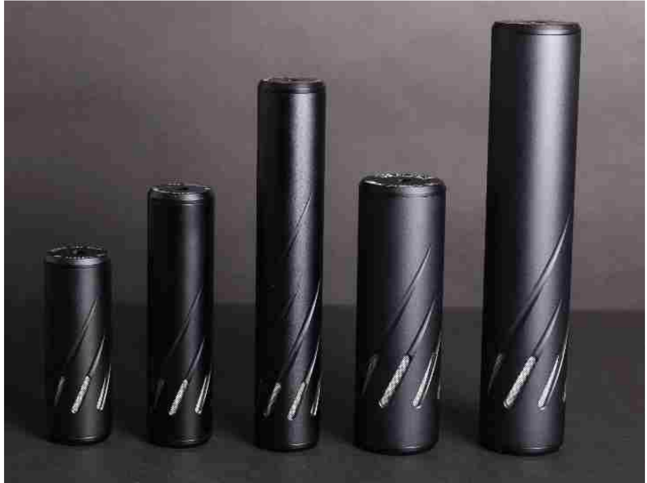
L to R: Atom, Belita, Snipe, Mini-Magna, Magna.