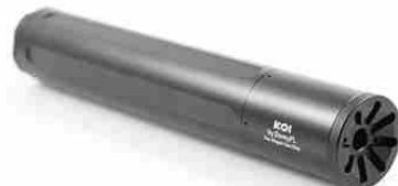
1.22 x 7 inches KOI