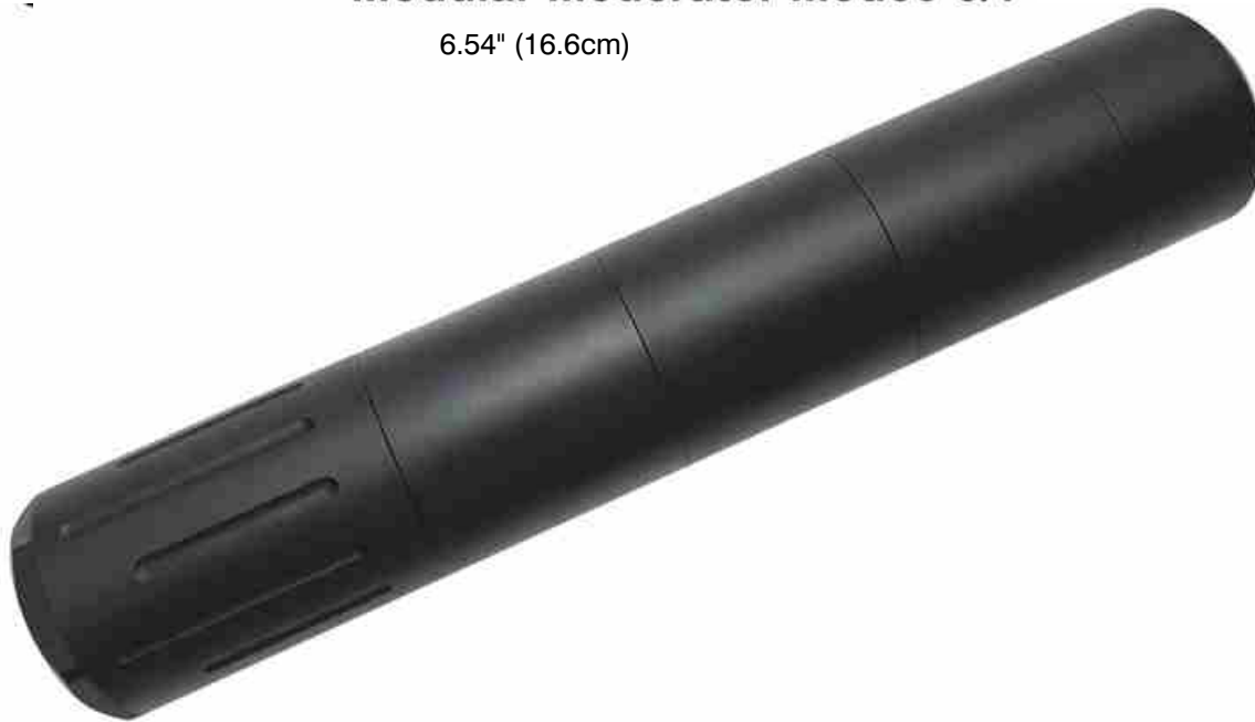
Modular Moderator Mod40-4/1