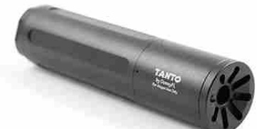
1.22 x 5 inches TANTO