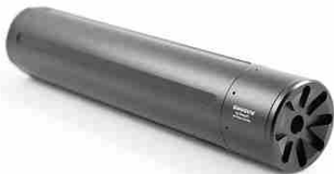
1.6 x 8 inch SHOGUN