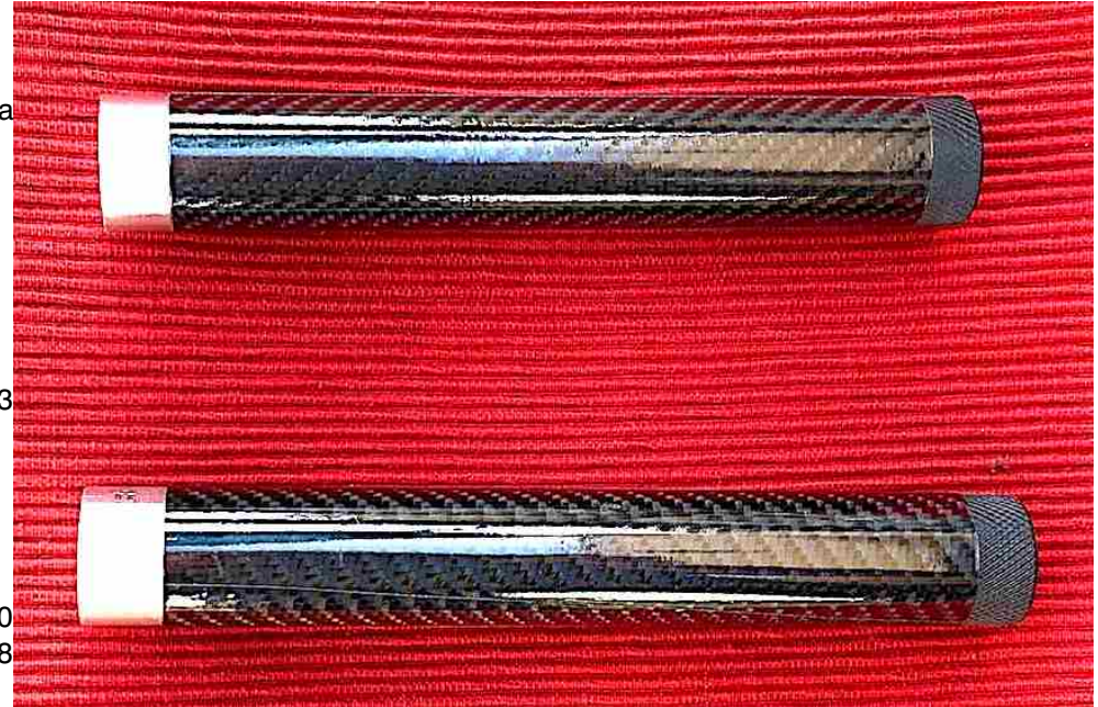
Rocker1 (top) and Rocker2 (bottom)

Data source: https://www.gatewaytoairguns.org/GTA/index.php?topic=182340 https://www.gatewaytoairguns.org/GTA/index.php?topic=182738 and personal email