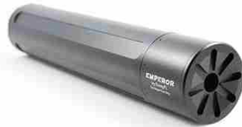
2 x 10.5 inches EMPEROR v3