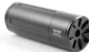
1.6 x 4.25 inches TATSU