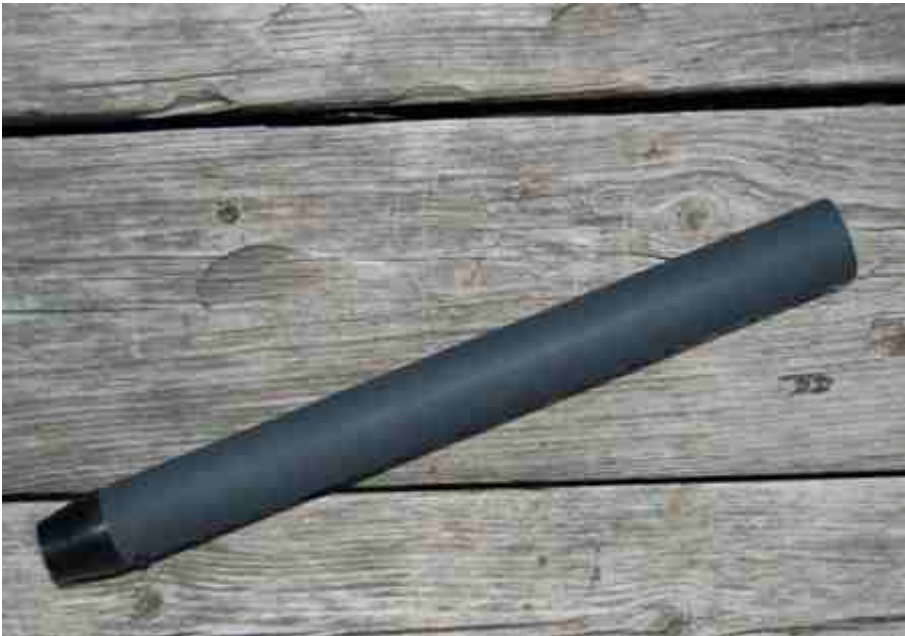
“Gun metal gray”

For ideas and options , cf. the following photo gallery: http://www.tko22.com/TKO_gallery/