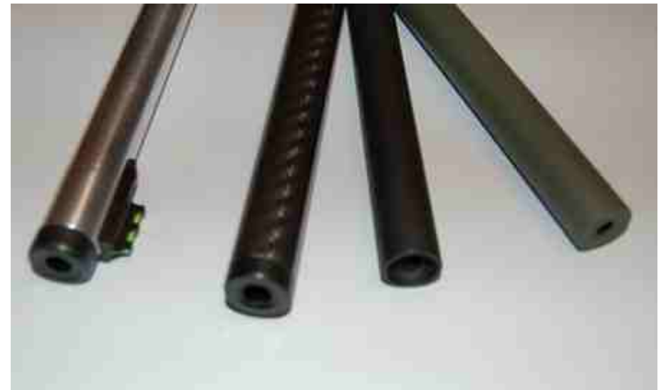
Various end pieces