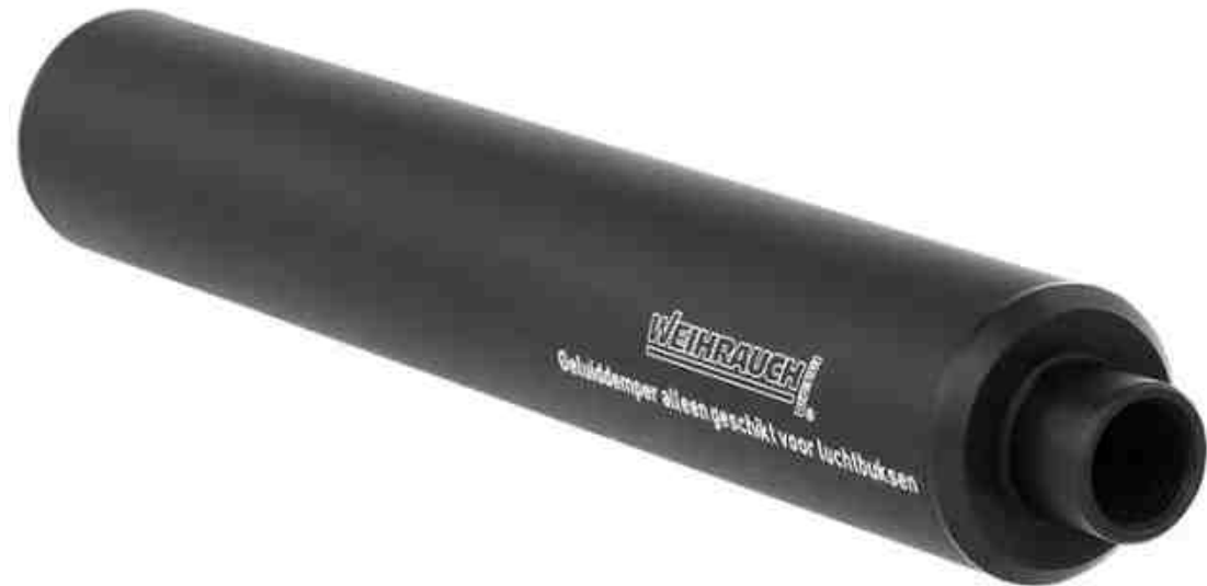
The originally for the HW100 developed silencer – fits 1/2 UNF

https://www.waffen-schlottmann.de/1168812_Schalldaempfer-der-Marke-Weihrauch-fuer-Luftgewehr-mit-Innengewinde-0-5-Zoll-UNF.htm