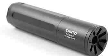
1.22 x 5 inches TANTO