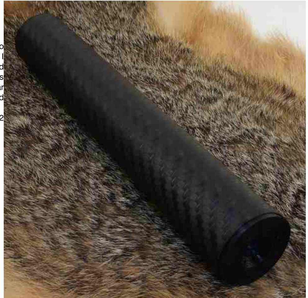
Construction: 3D printed monocoire set in a polymer shell with a decorative vinyl wrap

https://www.gatewaytoairguns.org/GTA/index.php?topic=178083.msg156020266#msg156020266