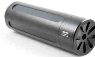
2 x 6.25 inch RONIN