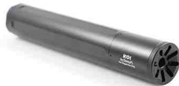
1.22 x 7 inches KOI