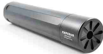
2 x 10.5 inches EMPEROR v3