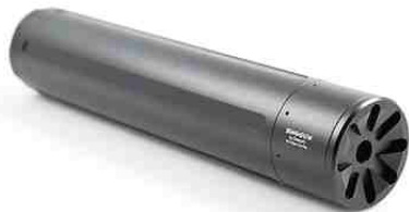
1.6 x 8 inch SHOGUN