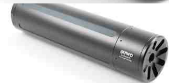
1.6 x 6.25 inch SUMO