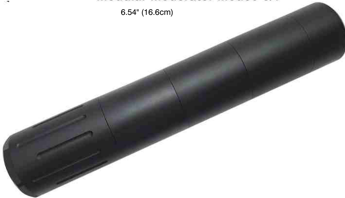
Modular Moderator Mod40-4/1