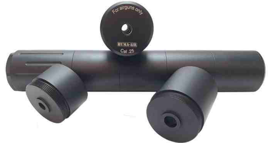
MOD40-5/0 = Long | 22.8cm