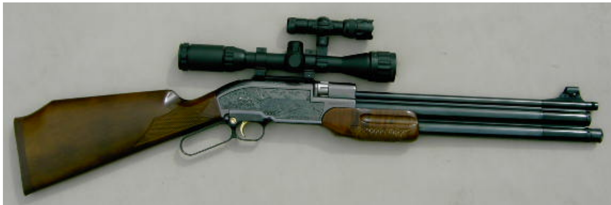
The Korean-made .22 EunJin Sumatra lever-action pneumatic repeater averages quarter-sized groups at 50 yards with 16 grain pellets at 900 FPS and 28 foot-pounds.

About dark-thirty I and Rusty The Wonder-Dog were startled by a screeching cat-fight on the front porch. Rusty went ballistic, almost busting down the door as I grabbed the scoped .22 precharged-pneumatic lever-action air-rifle I'd mounted a light on in preparation for the return appearance of Whiskers' attacker. As Rusty and I came busting out the door, the big gray-and-white streaked up the closest tree. BIG MISTAKE!