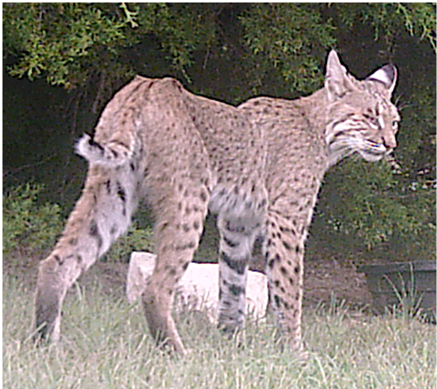
last the widow injured probably